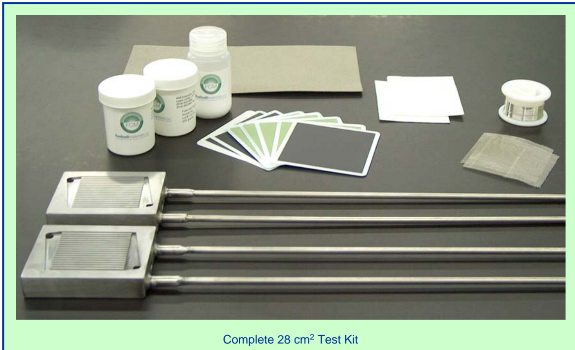
Complete 28 cm 2 Test Kit

Complete, cost effective high temperature cell mounting kits - Works with most test stands Excellent gas flow configurations and electrical connections - Minimize temperature gradients and enhance reproducibility Low chrome content - Minimize cathode contamination Solutions for sealing and interconnection - Begin to take measurements quickly and easily Spare parts readily available to keep you running Experienced staff to support your efforts