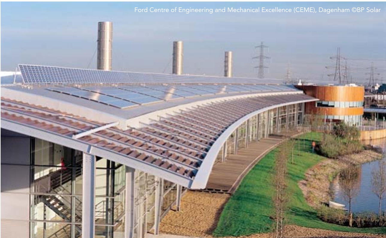
Ford Centre of Engineering and Mechanical Excellence (CEME), Dagenham